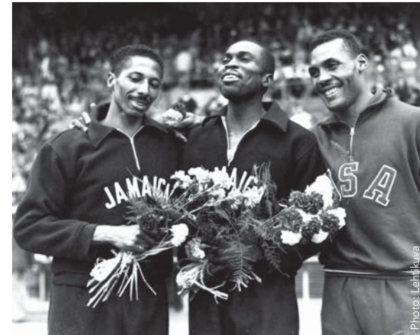
Jamaicans George Rhoden (centre) and Herb McKenley (left) won gold and silver medals respectively in the 400 metre race at the Olympic Games in Helsinki in 1952.